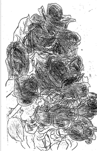
Springtime roses by Betty Payne

*Please only one winner per household & only one win during a 12-month period.